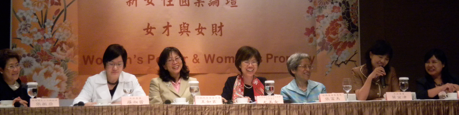
ABOVE: Panelists speaking at BPW Taiwan - Women's Power and Women's Property Forum